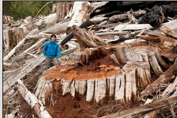
Some Oregon logging mills will go to great lengths to get ancient trees. This stump is in the Gordon River Valley on Vancouver Island, BC. Herbert Lumber imports trees from British Columbia.

Big Logs: This company purchases logs larger than 30 inches in diameter.